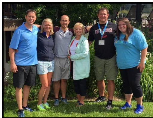
MN group at Leadership Summit

As the new school year begins please remember the importance of our profession. With the short amount of time that a student spends in school during their lifetime we are the ones that will prepare them for a healthy active lifestyle. We are the ones that can inspire and influence these students to make the right choice when it comes to healthy living.