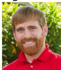
2015 SHAPE America National Adapted PE TOY Oregon