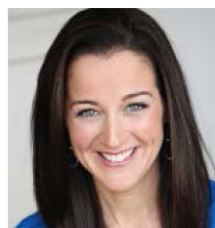
Founder/Owner Move Live Learn, LLC Missouri