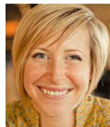
2014 SHAPE America National Dance TOY Colorado