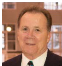
Professor of Adapted Physical Education/Activity at Texas Woman's University