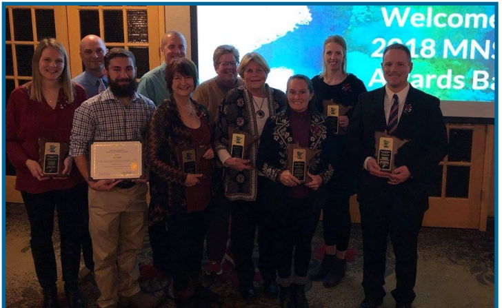
2018 MNSHAPE Award Winners