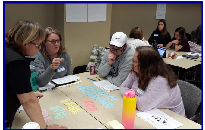
PE Workshop Bundling example