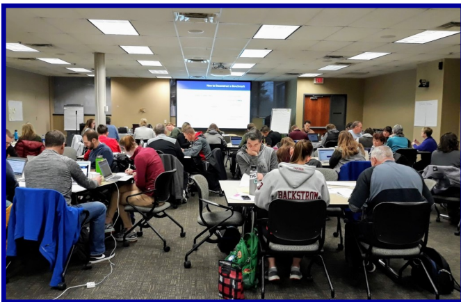
PE Workshop deeper dive into the benchmarks